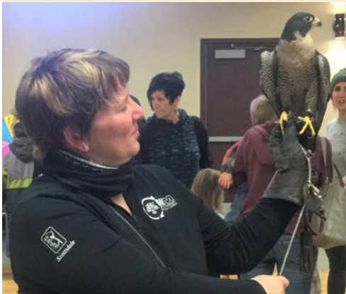
Vinnie the Peregrine Falcon

Thanks to the generous funding provided by the Colchester & District Agricultural Society, the Bookmobile hosted a very successful Winter Wizardry Reading Game in 2019. Over 380 children read for a total of 1113 hours.