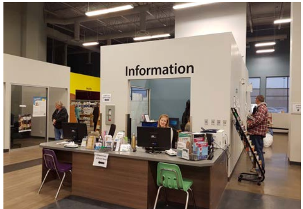
March at Baseline Village Library