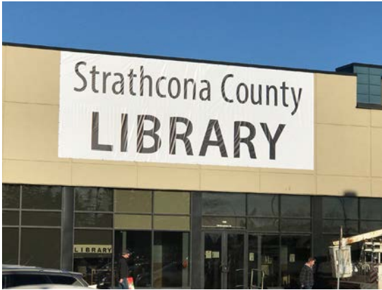
Come and find us!

Temporary Facility: Baseline Village Dec 2018 - Apr 2019