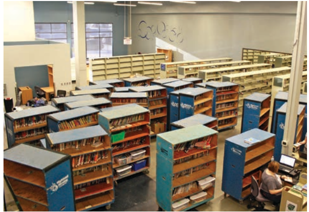
Transforming a gym into a library