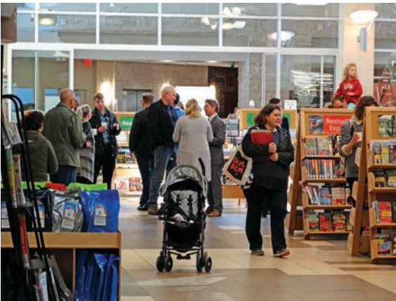
Opening Day at Central Library