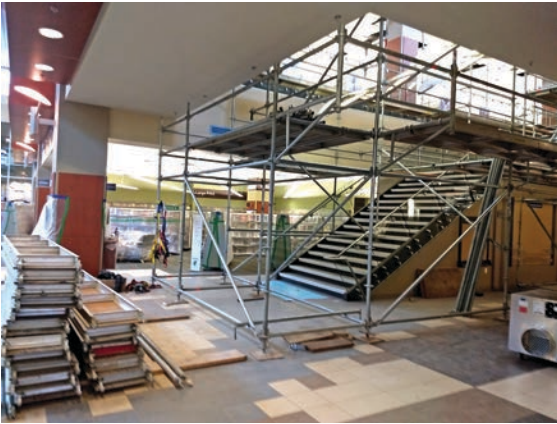
Cleaning and replacing