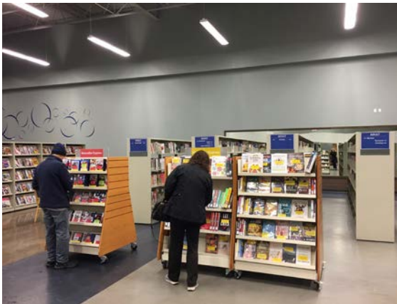
Opening Day at Baseline Village Library