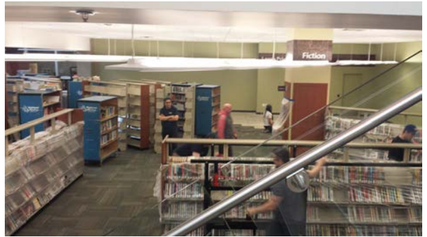
Transforming a library back into a library