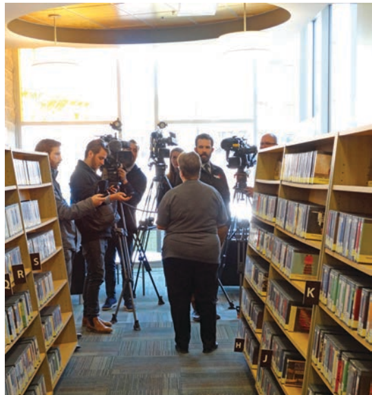
Library in the News